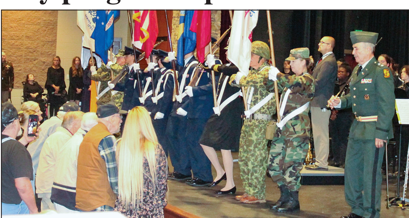
recently, they've begun visiting Local Civil Air Patrol cadets were joined onstage by the American Legion Color Guard for the annual School Veterans Day

Today, the Honor Guard salutes veterans to make sure they receive full military honors at their funerals. They also present and fold flags, and See School Veterans Day, Page 6A Program Friday.