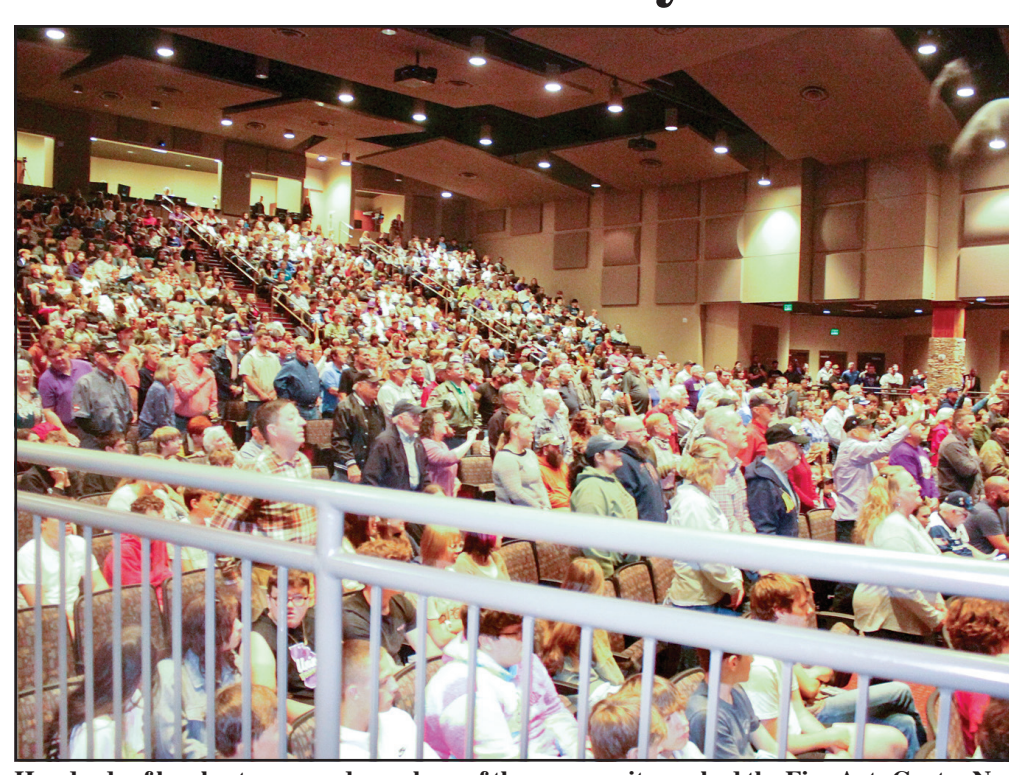
Hundreds of local veterans and members of the community packed the Fine Arts Center Nov. 10 in patriotic support of the School System's efforts to honor veterans for Veterans Day, which is Nov. 11 every year.

Union County and Woody Gap schools to teach proper flag etiquette classes.